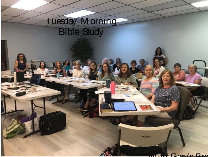
Tuesday Morning Bible Study