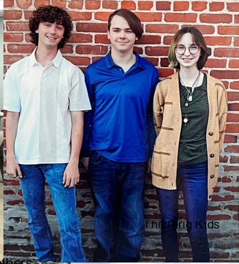
The Dorig Kids